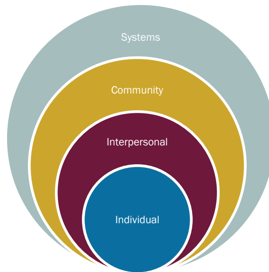
Figure 2: Social-Ecological Model

Below are some strategies and examples that organizations can use to approach change, using a trauma-informed lens. These strategies were informed by BRIDGE Housing Corporation's report on trauma-informed community building .