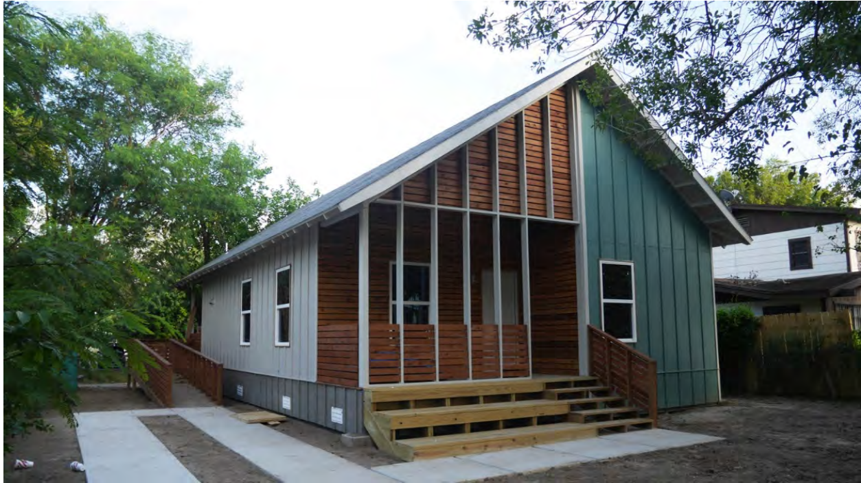
Figure 3: RAPIDO Expanded CORE