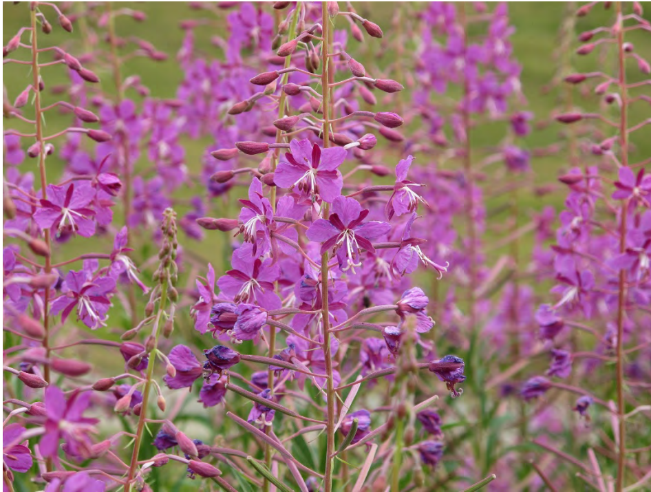
Figure 6: Fireweed, a Pioneer Species in the American West