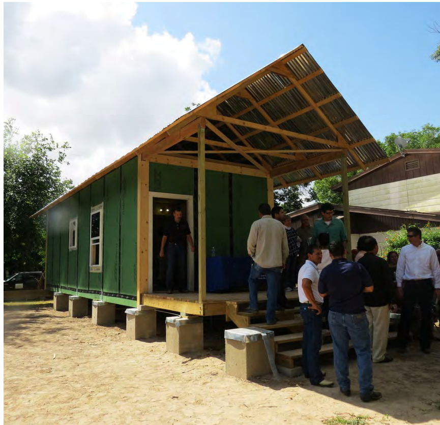
Figure 2: RAPIDO CORE Unit