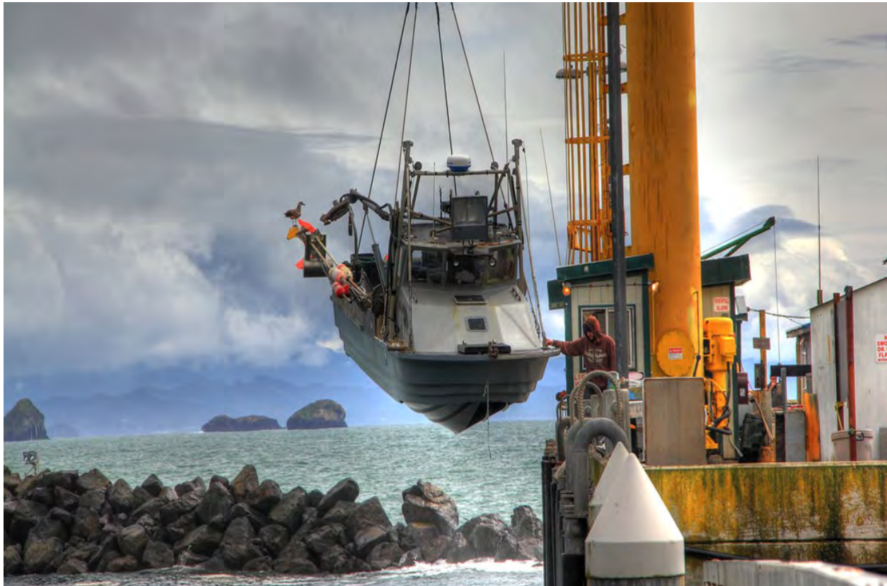
Figure 4: Port of Port Orford Operational Dolly Dock, Port Orford, Oregon

local consumers. It was also a missed business opportunity for towns that stood to gain from the wealth that a processing plant could bring to their communities. A prime example of the need for improved infrastructure was Port Orford, where the dolly dock port was at risk of closing due to physical decay.